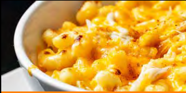
MAC + CHEESE